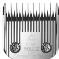
#4 Skip Extra Coarse 8mm 02374-116