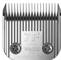
#7F Full Medium Coarse 4mm 02368-116