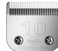
#10 Medium 1.8mm 02358-116