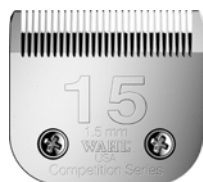
#15 Medium Fine 1.5mm 02357-116