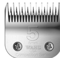
#5 Skip Coarse 6mm 02371-116