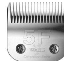
#5F Full Coarse 6mm 02372-116