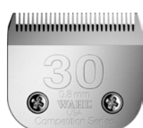
#30 Fine 0.8mm 02355-116