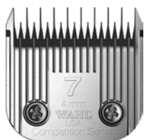
#7 Skip Medium Coarse 3.8mm 02367-116