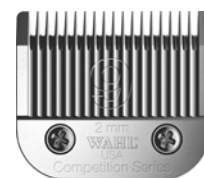
#9 Medium 2mm 02360-116