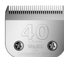
#40 Surgical 0.6mm 02352-116