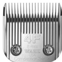
#4F Full Extra Coarse 8mm 02375-116