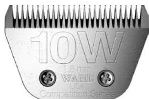
#10W Extra Wide 1.8mm 02377-116