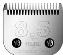
#8.5 Medium 3mm 02362-116