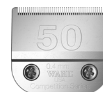
#50 Ultra Surgical 0.4mm 02350-116