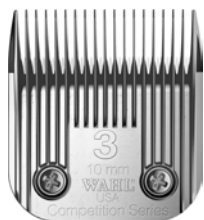
#3 Full Coarse Extra 10mm 02376-116